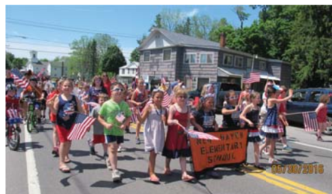
New Haven Elementary School - New Haven Parade