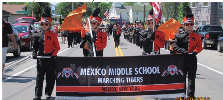
Above: Mexico Middle School Marching Band - New Haven Parade

Mexico Academy and Central School proudly participated in both the Mexico and New Haven Memorial Day Parades and Cemetery Services on May 30, 2016.